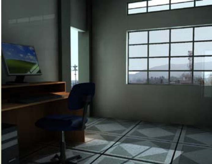
3D rendition of our office in Shillong, India